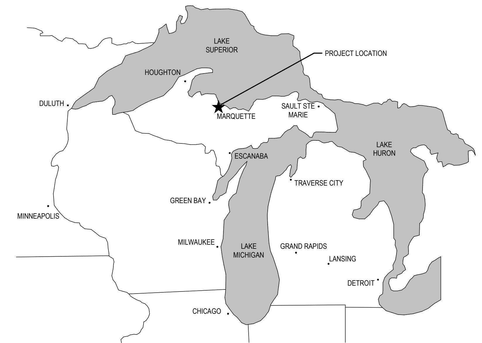
AREA LOCATION MAP